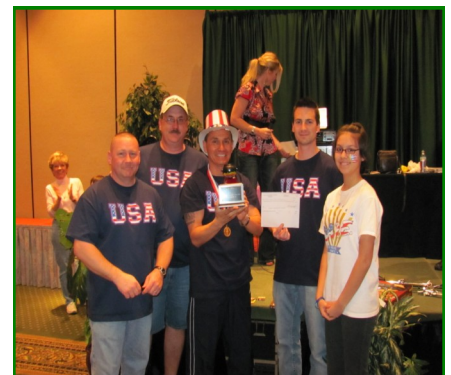
First Place Winners 2010 Osage Beach Police Department

If you are interested in entering a team or would like further information about the event please call CADV at 573-346-9630.